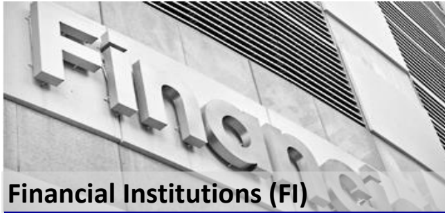
Financial Institutions (FI)