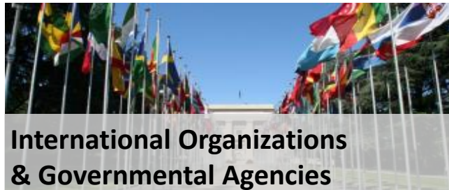
International Organizations & Governmental Agencies